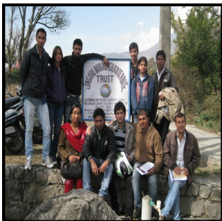
Students of MSW At Jagori (NGO)