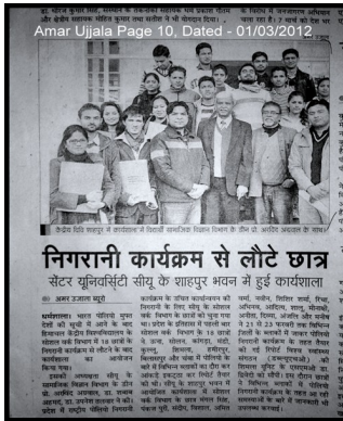
Students of MSW with Dean and SMO after the Debriefing session in TAB campus