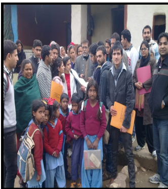
Students of MSW with SMO getting Field Work Training in Bengali Colony

To work as Monitors they also got training from Surveillance Medical Officer (SMO) of NPSU. This was the first time in the history of the state when non-medical professionals are asked to conduct 'Monitoring of different districts of Himachal Pradesh. Apart from appreciation certificate from WHO, students were paid a sum of Rs 735/- day (Outside District) and Rs. 420/- day (within District).